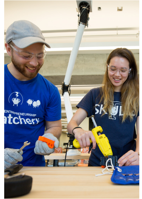
University of Toronto engineering students.

Students often tell us how they feel deeply moved to receive this support and inspired to continue giving their best. With your generosity, we can extend these opportunities to even more bright students from every financial background and circumstance, and help to create a more equitable future where everyone can thrive.